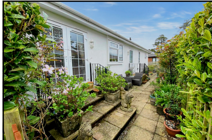
Pitch Fee: approx £715.38 per quarter Subject to Annual Review Council Tax Band: 'A' <u>Tenure</u>:

x Band: 'A' Tenure: 1983 Mobile Homes Act Agreement